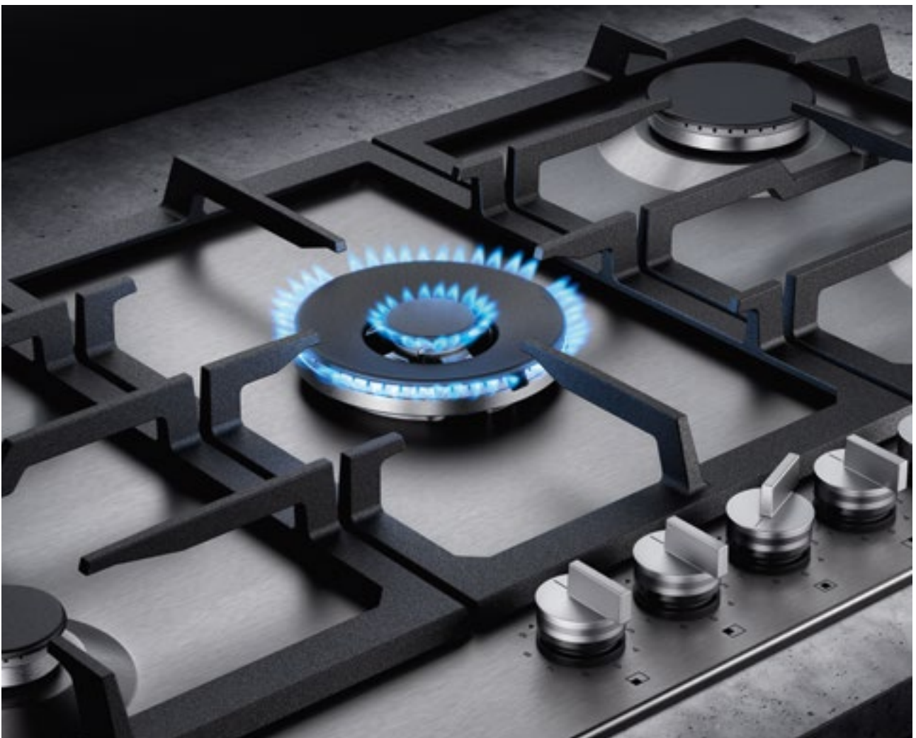
Gas cooktop 200 series, CG 291