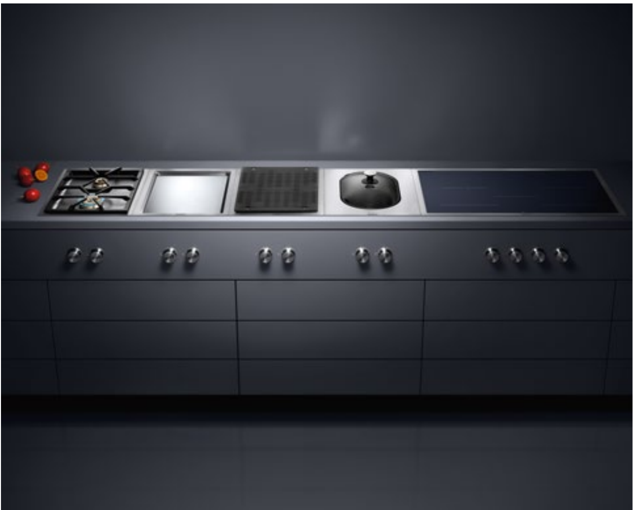
Vario gas cooktop 400 series, VG 425