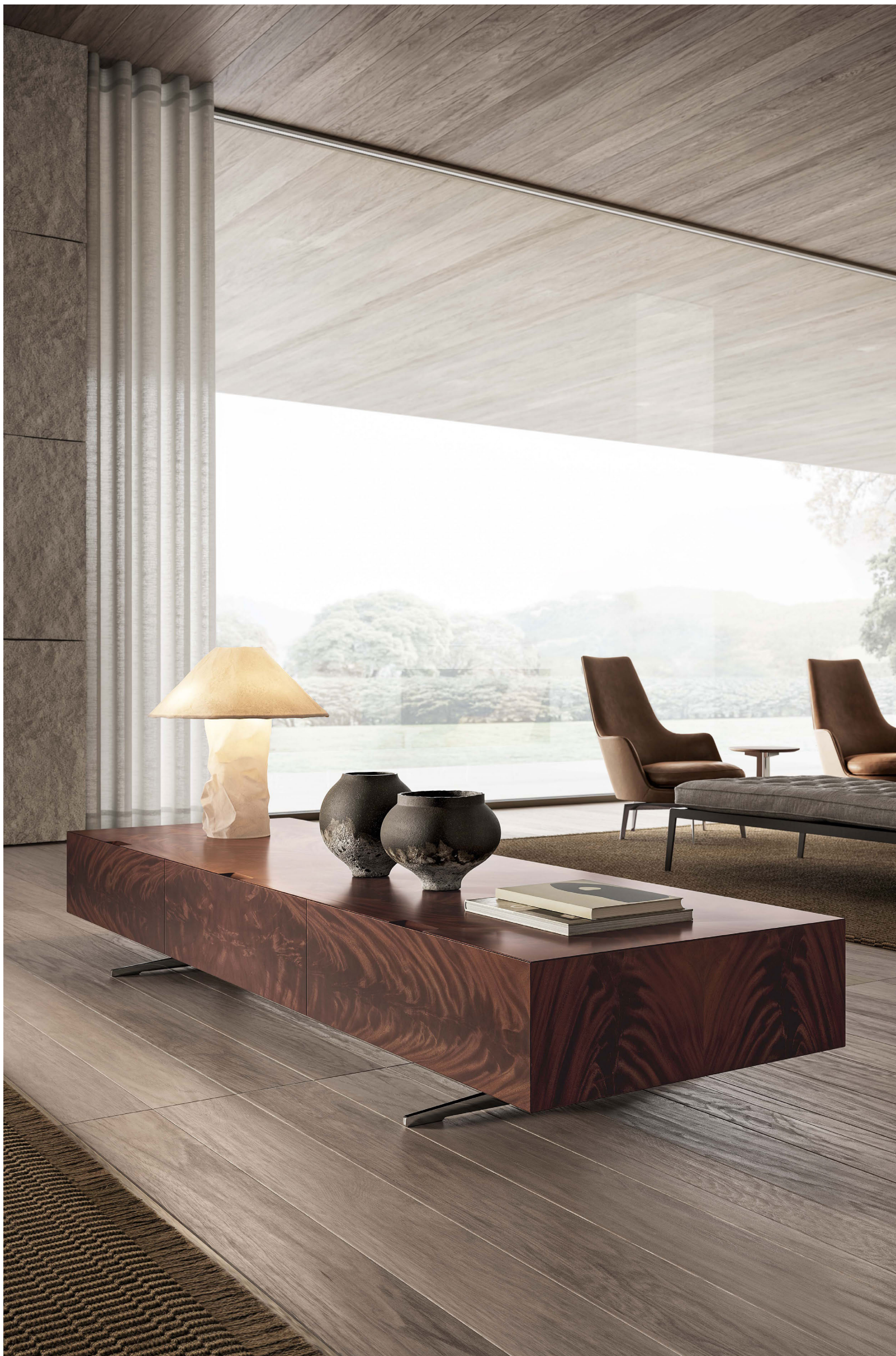
PIUMA, STORAGE UNIT

Struttura impiallacciata in piuma di mogano, piedi in metallo cromato nero. Structure feather mahogany veneer, feet black chrome metal.