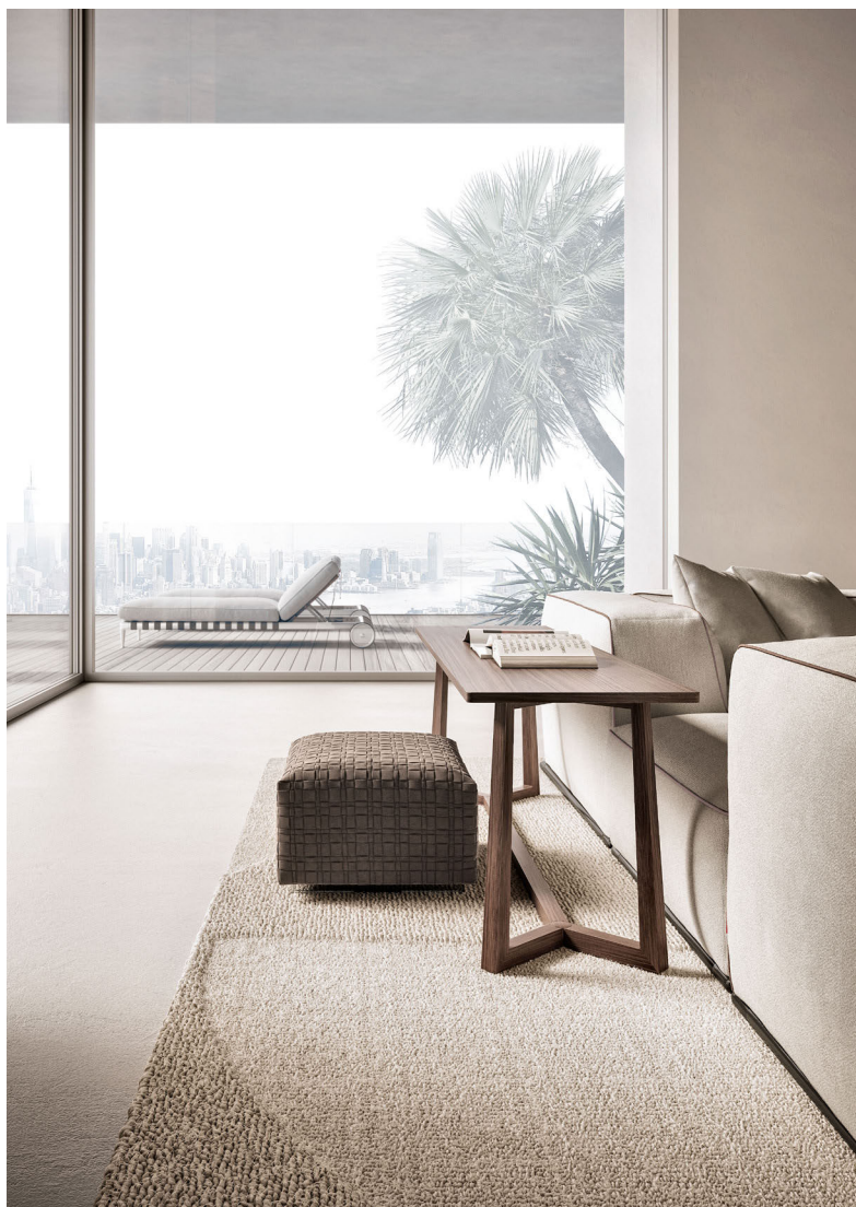
JIFF, SIDE TABLE AND CONSOLE TABLE - BANGKOK, OTTOMAN

Struttura e piano in noce Canaletto. Piedi in metallo satinato, seduta rivestita in cuoio scamosciato intrecciato color testa di moro 6004, Design Center design. Structure and top Canaletto walnut. Feet satin-finish metal, seat upholstery woven suede dark brown 6004, Design Center design.