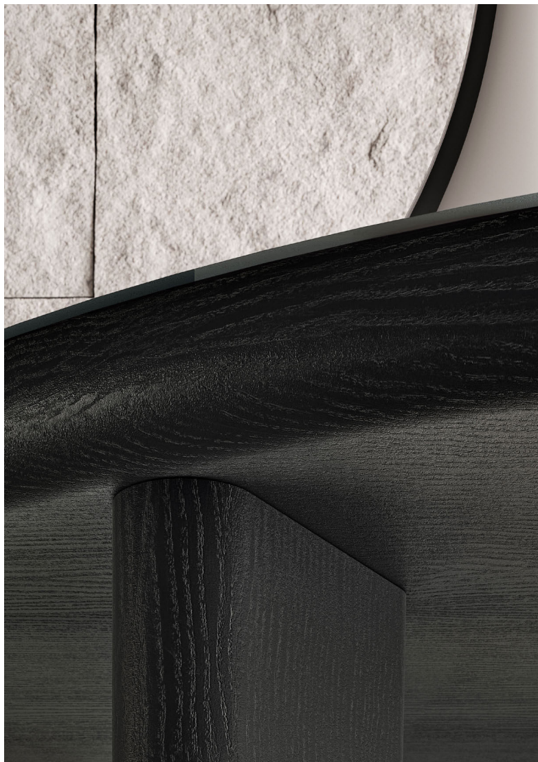
ARNOLD, TABLE - ALMA, CHAIRS - INCA, CARPET

Gambe in frassino tinto ebano, piedi metallo cromato nero, piano in vetro retroverniciato nero lucido 2040. Seduta e schienali rivestiti in tessuto Topazio 993, gambe in metallo brunito. Tappeto Inca lana e cotone, colore Stone, Juma design. Legs ebony color stained ash, feet black chrome metal, top glossy back-lacquered glass black 2040. Seat and backrest upholstery fabric Topazio 993, legs burnished metal. Wool and cotton carpet, color Stone, Juma design.