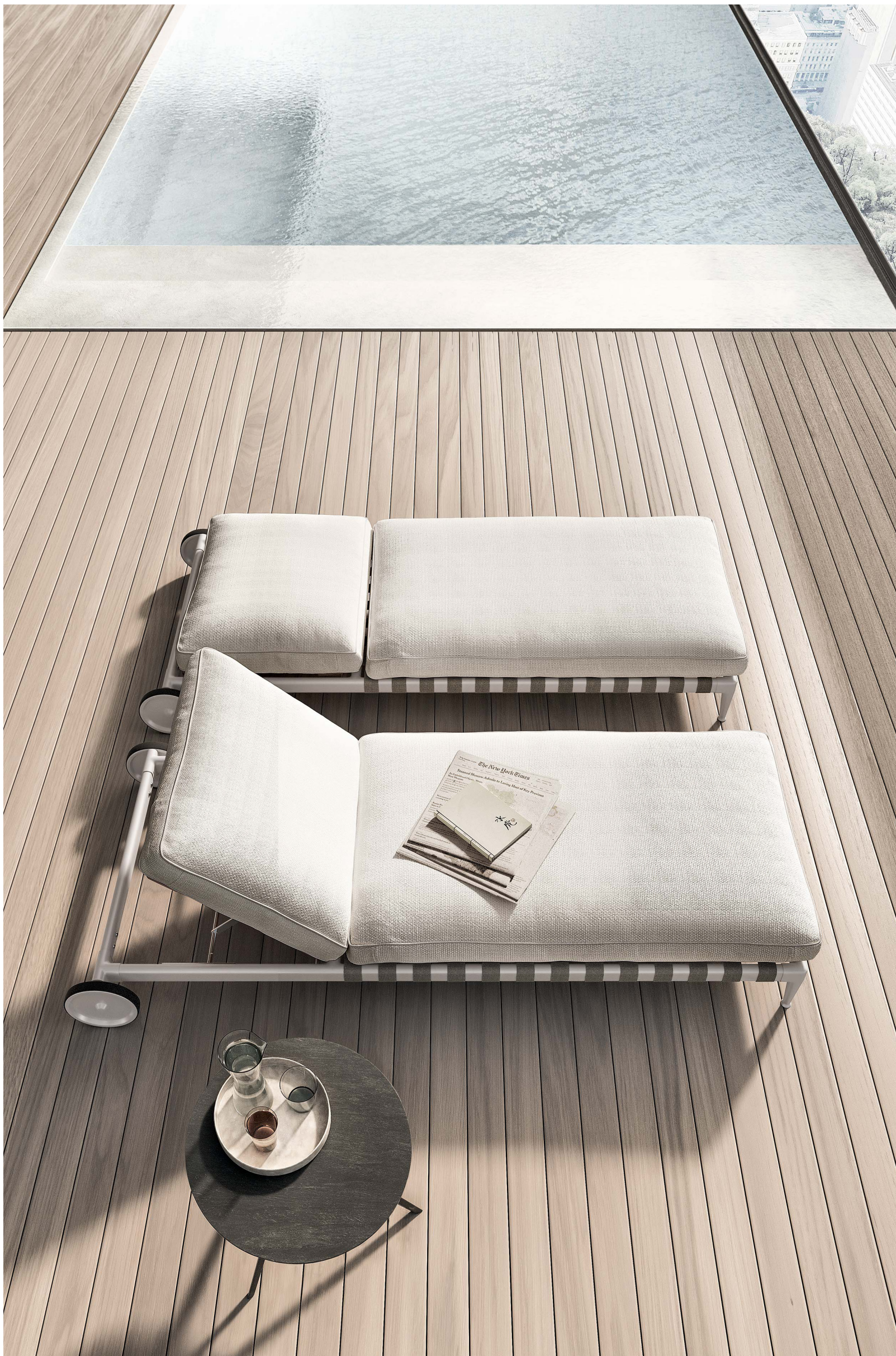
ATLANTE, DAYBEDS - ZEFIRO OUTDOOR, SIDE TABLE

Struttura in alluminio verniciato a polvere epossidica colore bianco 100, cinghie elastiche color sabbia 9001, schienale reclinabile in iroko massello finitura naturale, rivestimento tessuto Borneo A201, profilo in gros grain 607. Gambe in alluminio brunito, piano in pietra del Cardoso. Structure aluminum epoxy powder-coat white 100, elastic webbing sand 9001, reclinable backrest solid iroko wood natural finish, upholstery fabric Borneo A201, grosgrain piping 607. Legs burnished aluminum, top pietra del Cardoso.