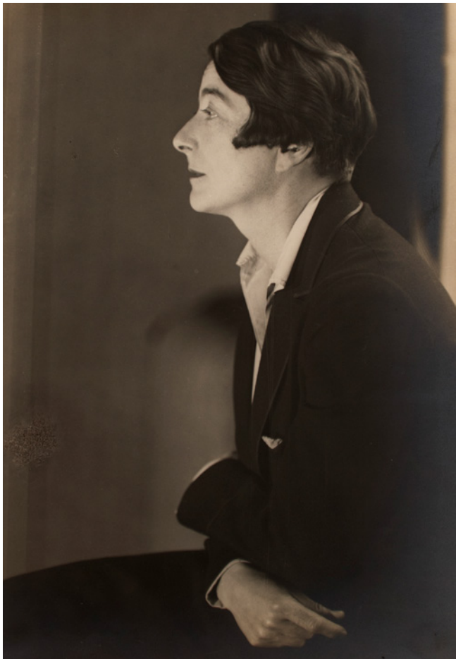
Portrait of Eileen Gray. Photo by Berenice Abbott, 1926