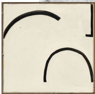
PHOTO Jean Désert showroom. Photo by Eileen Gray, c. 1926–29 ARTWORK Untitled. Gouache on paper, c. 1922–29