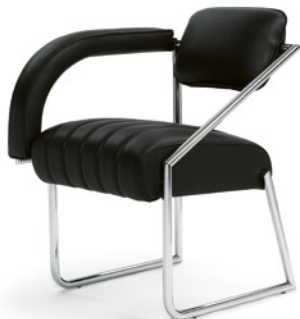
ABOVE Non Conformist Armchair, designed 1926

Green is also the colour of hope, and, with regard to her painterly works, it never deserted the aged Eileen Gray. She had always hoped that new textile works of art would once again emerge from "old designs". After Aram Designs Ltd. in 2003 and ClassiCon in 2004 included the first carpets based on her designs in their collections, the current exhibition now continues to comply precisely with this last wish of Eileen Gray.