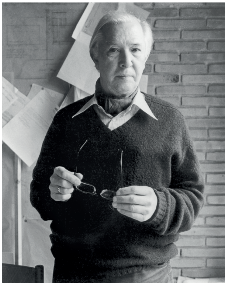
HANS J. WEGNER 1914 – 2007