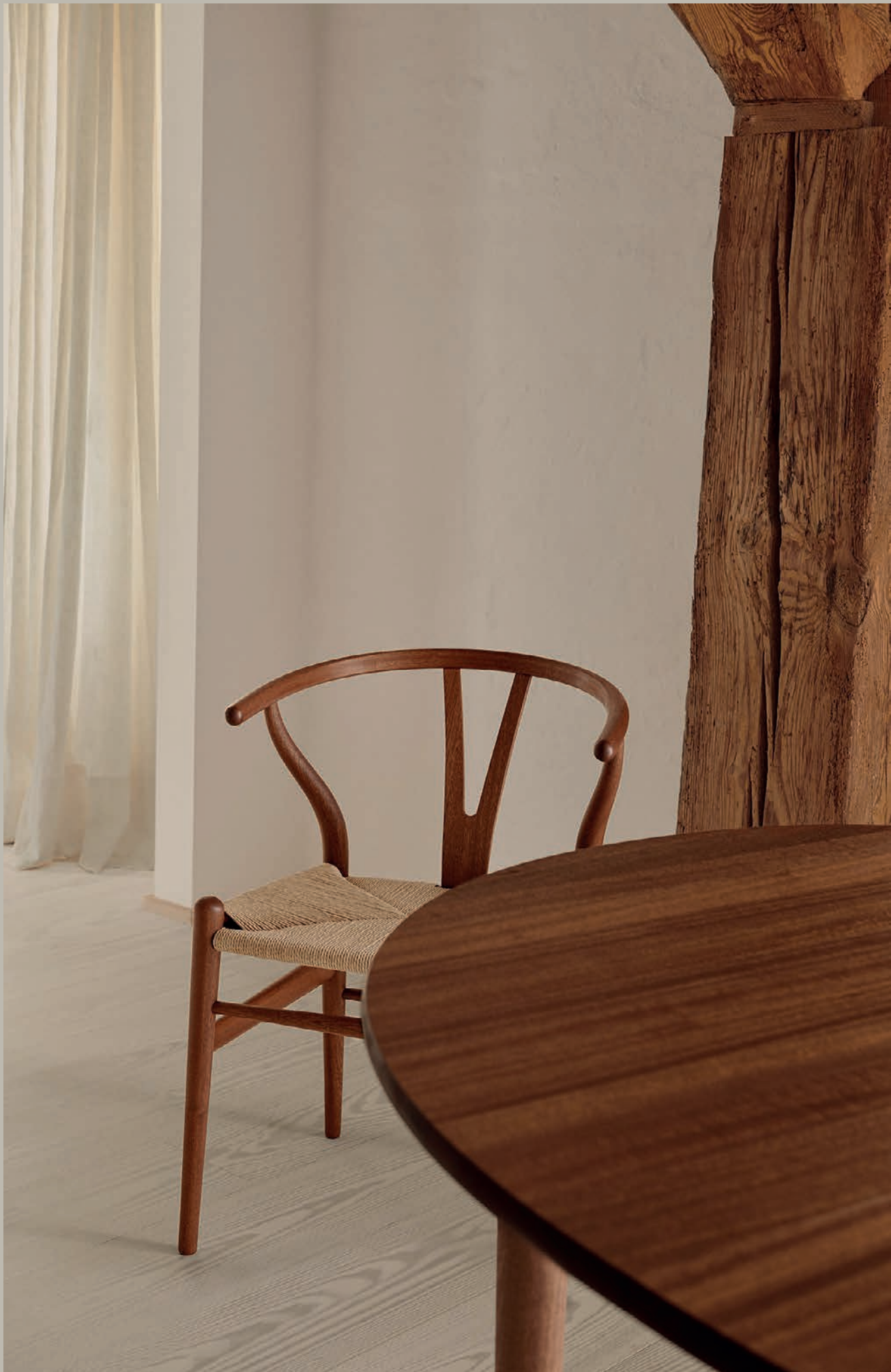
SELL-IN MATERIAL CH24 MAHOGANY